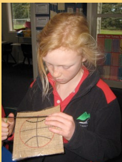
Tarahaoa Hubs grand craft in action!