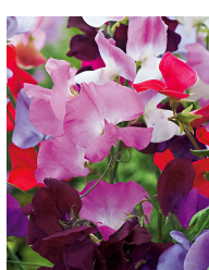
Sweet Pea - Early Multiflora