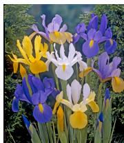
Dutch Iris Mixed