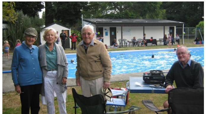
Carew Community Pool Party Feb, 2013