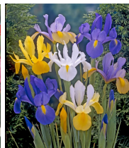
Dutch Iris Mixed