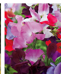
Sweet Pea - Early Multiflora