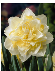
Daffodil Double "White Lion"