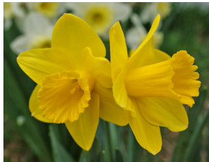
Daffodil "King Alfred"